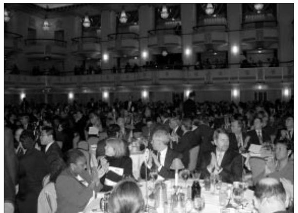
Over 800 attendees filled the Grand Ballroom of The Waldorf Astoria for the event